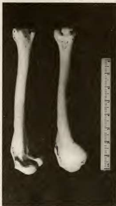
Fig. 2. Two humeral bones of shelduck ( Tadorna tadorna ) from Veliki Preslav (9th — 10th century A.D.).

The subfossil remains of the native nominative form of the common pheasant ( Phasianus colchicus colchicus ), are of greater interest for clarifying its distribution in the past on the Bulgarian lands. There is no identical opinion considering the ori-